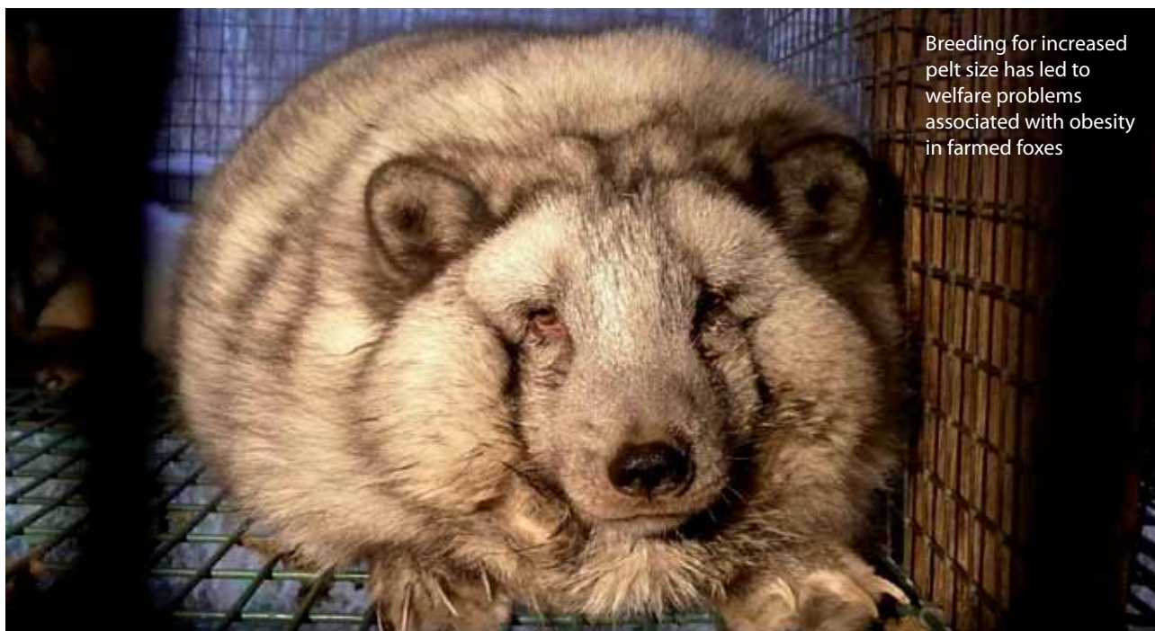
Breeding for increased pelt size has led to welfare problems associated with obesity in farmed foxes

and vitality. 182,183 Farmed mink weigh approximately twice as much as wild mink 184 and have relatively smaller brains, hearts and spleens. 185,186 Breeding for increased body/pelt size has resulted in animals that tend to become overweight when fed ad libitum . As a result, mink are usually fed a restricted diet to reduce their weight in preparation for breeding, leading to hunger and an increase in stereotypic behaviour 187 (see Section 5.2). Selection has also resulted in increased litter size in farmed mink, 188 which contributes to welfare problems associated with loss of body condition during lactation. 189