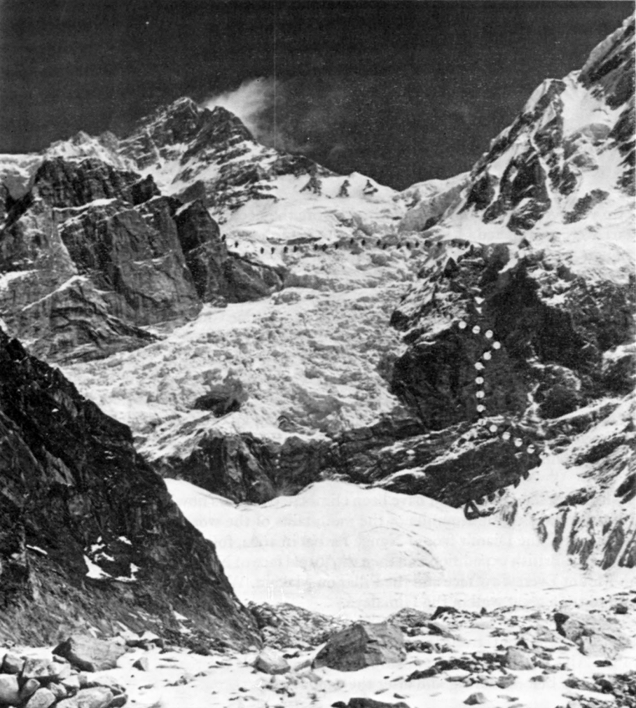
3 Manaslu from Base Camp This and next photo: Tiroler Himalaya Expedition

Mount Everest sw wall, and also more difficult than all the other routes they knew. We were very pleased with all our Sherpas; they were friendly, hard working, cooperative and we became great friends with them.