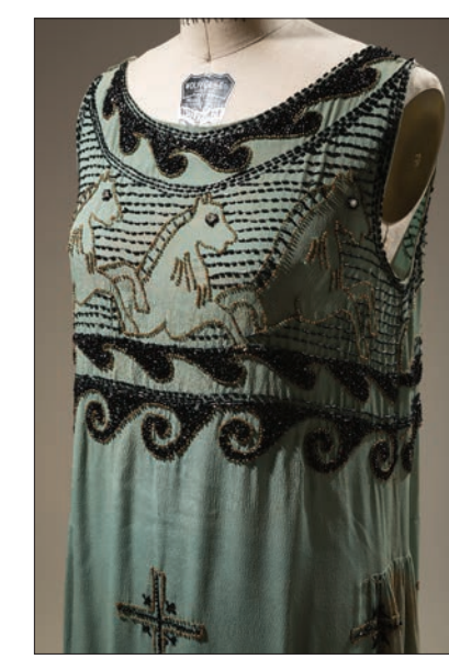
Unlicensed copy of Madeleine Vionnet's "Little Horses" dress, rayon crepe, black and gold seed beads, circa 1925, USA.