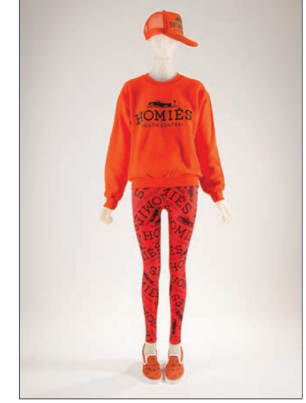
Brian Lichtenberg, Homiés ensemble, cotton, polyester, rubber, 2014, USA.

France, Italy, and the United Kingdom now have strict laws against copying a unique fashion design, but there are still no such laws in the United States. The Innovative Design Protection Act of 2012 (IDPA) aims to protect designers' intellectual property rights. This measure has been proposed in Congress, but has not passed. Meanwhile, debate still rages within the fashion industry over whether such an act would benefit creativity or stifle it. Whether or not fashion design will receive the same legal protections as music, art, publishing, and other creative fields remains to be seen.